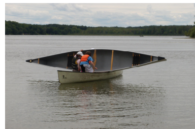
Learning the canoe over canoe rescue

Full Moon On The River is accredited by the Ontario Recreational Canoeing and Kayaking Association